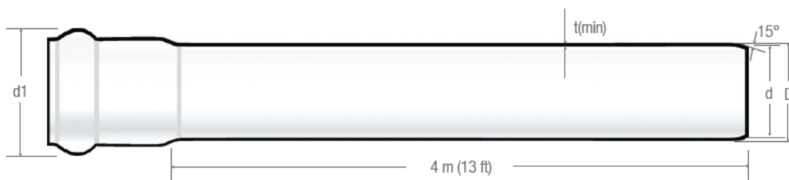
Illustration not to scale

All dimensions and weights are approximate